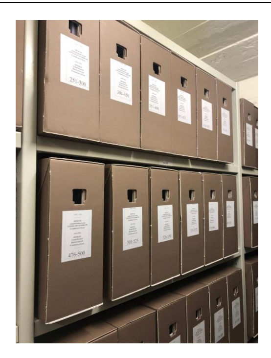
Figure 3. Military courts records boxes at the National Archives 2 - Joseph Cuvelier repository

After their repackaging, the material scope of the archives is of 194 record boxes for 27 linear metres, distributed as follows: