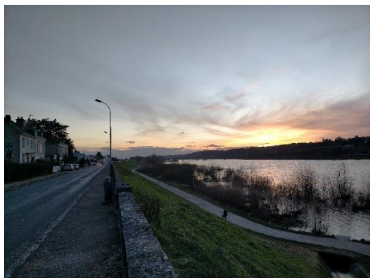
Blois / Picture by Jérôme Cardinal / February 2021

Furthermore, we aim to disseminate the project's outcomes to societal actors through 1) a concrete, demand-driven approach, 2) the involvement of external stakeholders during the project, and 3) a strategy to communicate to non-scientific stakeholders. Not only is SOLARIS grounded in current challenges to CCAP implementation, we also aim to actively involve institutional and private stakeholders in the project. In this way, the results of SOLARIS have practical relevance and contribute to a societal problem, namely the existence of socio-spatial inequalities in CCAP. A wide range of decision-makers and stakeholders will be identified for project dissemination activities, from different policy domains (e.g. flood risks and water management, broader climate change policy, health, transport, urban, and so on). One of the main research deliverables will be a practitioner's guide with the most relevant information and propositions to help address inequalities in CCAP. We also aim to have multiple local discussion groups in each case including authorities, NGOs, small businesses, communities and residents, which may contribute to the definition and improvement of future CCAP.