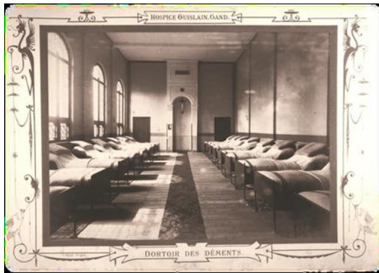
Gent, Hospice Guislain, Dortoir des déments, 1887

The project will apply a set of text mining and digital linguistic tools with a focus on the historically evolving use of concepts, arguments and discursive strategies. Specific computational applications, in particular automatic information retrieval will allow to quickly distillate in the large medical corpus relevant topics and passages for further scrutiny. Further text mining operations will be combined with conventional in-depth hermeneutical analysis of selected passages in an iterative interaction;