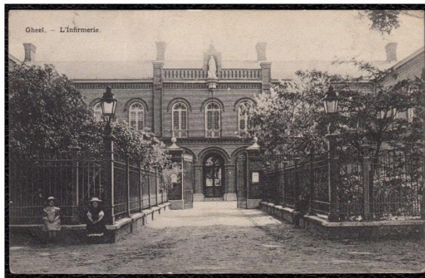
Postcard: Geel - Infirmerie, the central hospital of the state colony, build in 1862

In line with the second objective, the project will reconsider the role and the later memory of ideological conflict in 19th-century Belgian medicine. While Belgian political historiography has stressed the fundamental role of ideological conflict in 19th-century society, the role of ideological conflict has hardly been studied within the history of Belgian medicine. The main image which has come to the fore in contemporary memory constructions is an image of the medical profession as an almost homogeneously liberal and anticlerical body, which derived its identity from rather polemical representations of the physician as a modern substitute for the priest. Paradoxically, however, most physicians in 19th-century Belgium were Catholics.