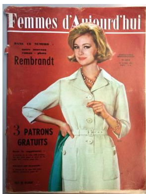
Cover of the magazine Femmes d’Aujourd’hui , n234, 27 April 1961

The photo novel, a form of visual narrative with staged photographs, generally printed in magazine format, was the dominant popular form in postwar pre-television Europe. At the crossroads of film novel, comics, melodrama, and serialized romance, its presence and impact were unequalled, and its adaptations and reappropriations in later periods remain an exceptional example of the dynamics of creativity and heritage, where they instantiate the visual turn in the transformations of reading and writing today. The Belgian contribution to the photo novel, important and very diverse, has been completely overlooked by the existing scholarship –which focuses mainly on the Italian and the French production - and the existing material hosted, yet hardly catalogued, by Belgian archives and libraries as well as in private collections, has never been explored, contrary to the well-studied domain of comics and graphic novels. To avoid any misunderstanding, by “Belgian production” we understand “made in Belgium”, that is: produced for Belgian publishers and published in Belgium. A large portion of the relevant Belgian collections is at the premises of KBR, such as Bonnes Soirées and Femmes d’Aujourd’hui/Het Rijk der Vrouw . The corpus covers both the period 1947-1965 (before the legal deposit) and 1966-today (since the introduction of the legal deposit).