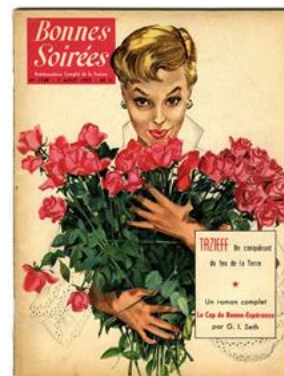
Cover of the magazine Bonnes Soirées , n1748, 7 August 1955