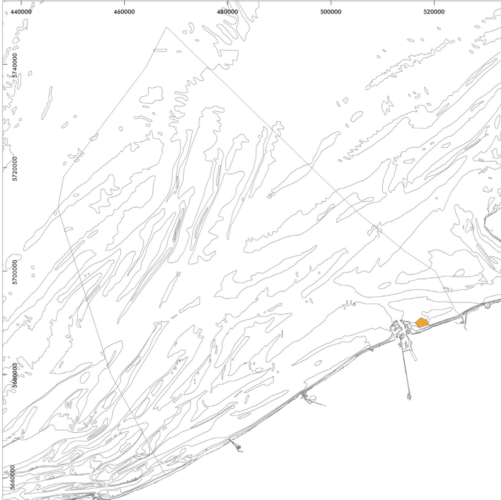
Map I.3.2a. Military ammunition: spatial distribution